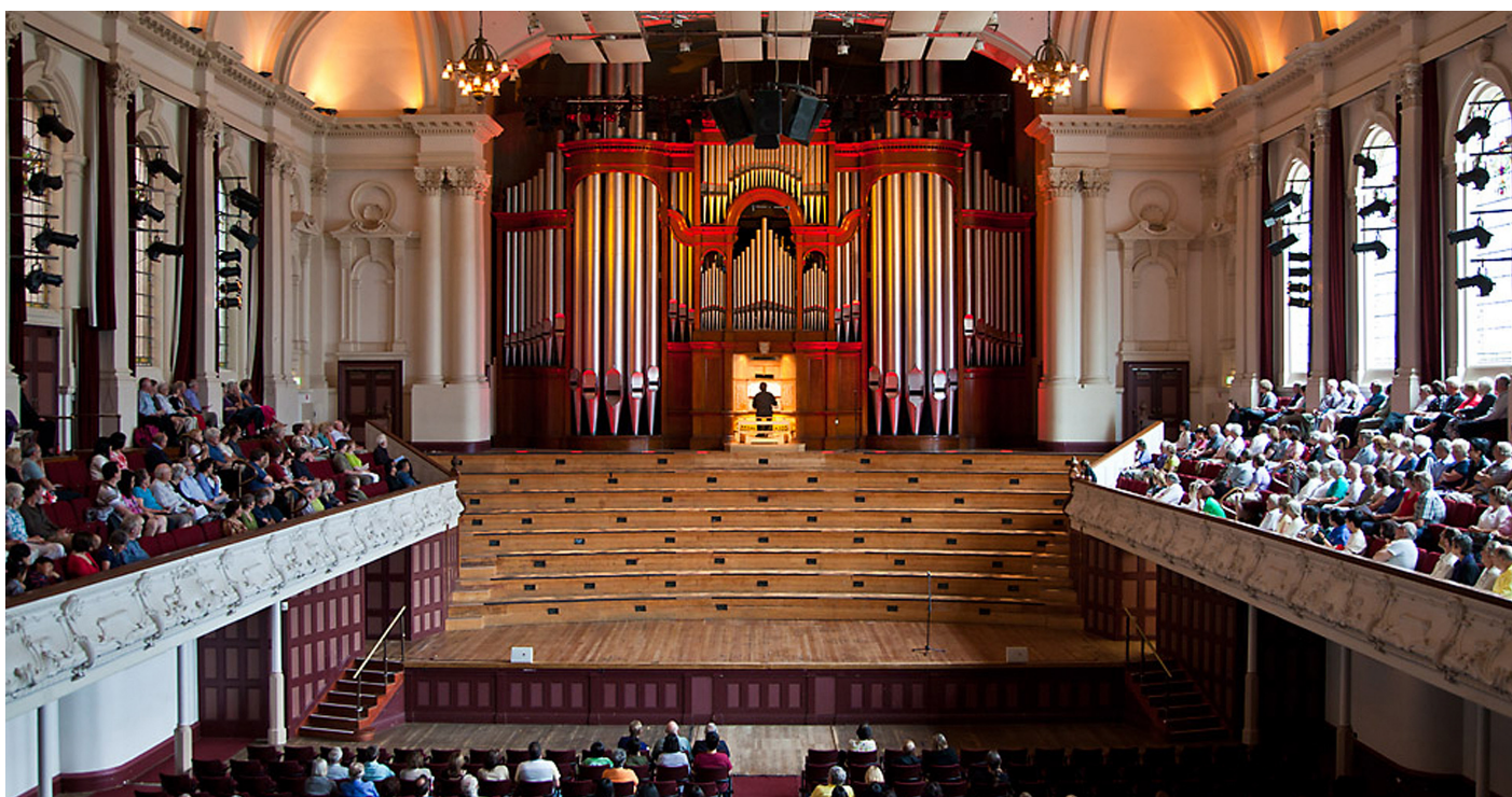
Fig. 1: The Great Hall of the Auckland Town Hall.

IRIS measurements were undertaken in a variety of positions in the Great Hall, and the results for one source position and three receiver positions are presented in this case study. The source, a dodecahedron loudspeaker, was placed at the centre of the stage, approximately 2 m back from the front and at a height of 1.5 m above the stage floor. The receiver positions, shown in Fig. 2, have the resulting IRIS plots overlaid. The microphone array was placed at listener head height, i.e. 1.2 m above the floor.