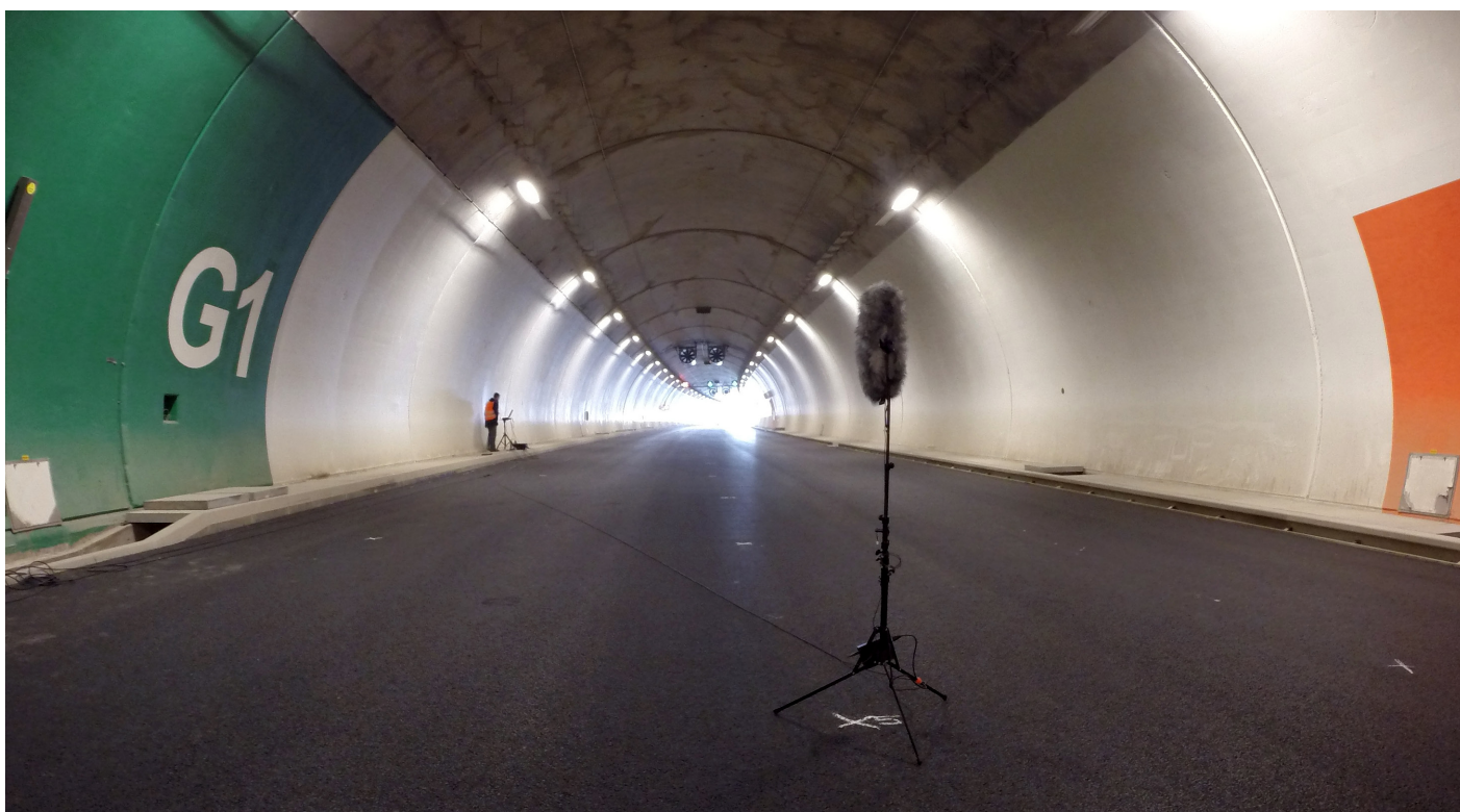
Fig. 1: The IRIS microphone set up inside the Grouft Tunnel in Luxembourg, with the ABF-260 visible in the distance (small grey rectangle above the fans).

Duran Audio developed the ABF-260 horn specifically for this purpose. It is intended to be mounted on the ceiling of a tunnel and projects sound along the length of the tunnel and downwards, with very little to the sides. This results in a higher direct-to-reverberant ratio than a simple loudspeaker, and therefore greater speech intelligibility.